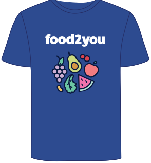
G. Juggle Your Fruit Blue