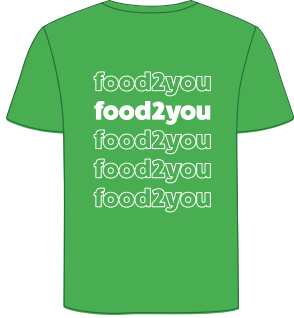
F. Green is Great