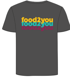
D. Rainbow Grey