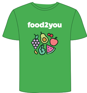
H. Juggle Your Fruit Green