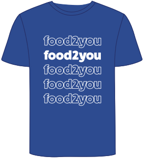
C. True Blue