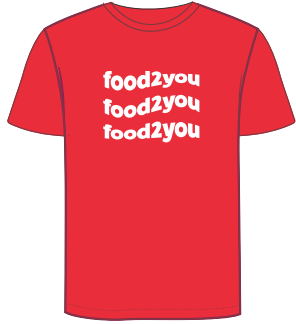
A. Roses are Red

Winners will be chosen at random at 8pm on 12/22/23.