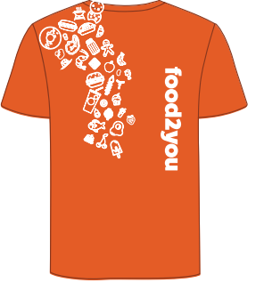
E. Tangerine Tango