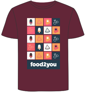
B. Pizza & Popsicles